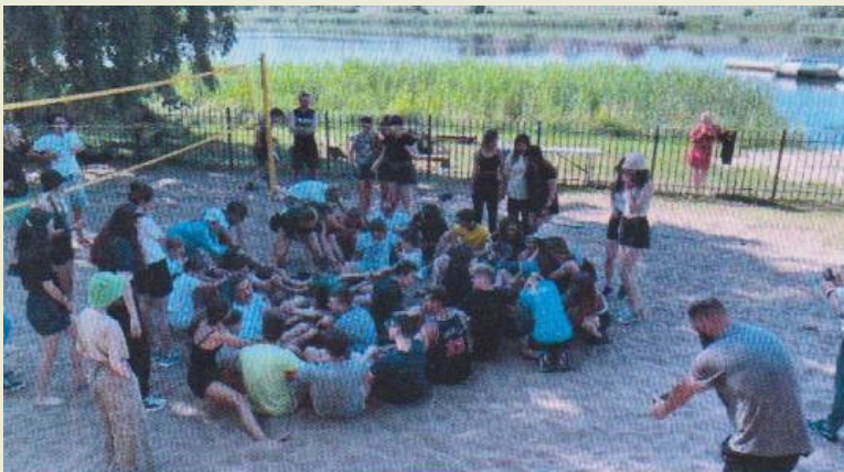
Youth group in Ostroda.

Nearly 60 youth from age 13-17 came to the camp. Most of them were from evangelical circles, young people who were eager to be together after a long time of separation due to Covid restrictions. For months schools in Poland were closed and youth were at homes having classes on-line. Many neglected their program. Several girls were from broken alcoholic families and required much counseling, care and prayers. It was great camp. I was there shortly with Grazyna supporting financially those who were in charge of the camp.