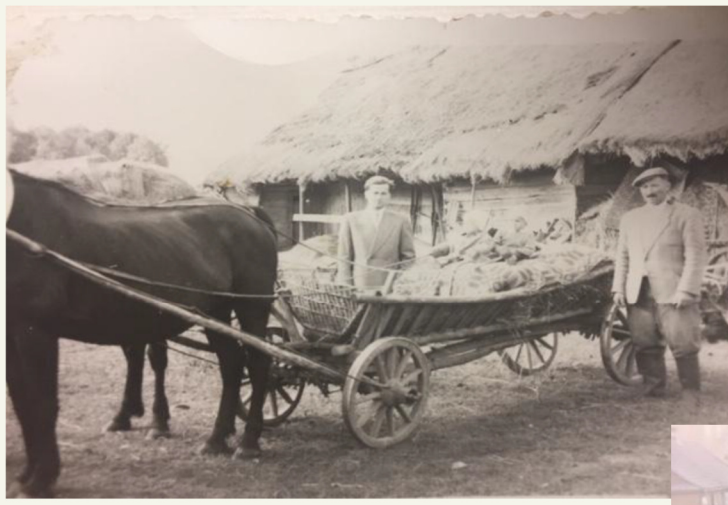
Dad on the farm with my granddad (me and my brother on horse carriage).

We were a poor family. Dad had to work hard to provide for the family. He worked in an office in a nearby city, traveling there by train every day and then returning home late in the afternoon riding his motorbike 10 miles to his parent's farm which had no electricity. There was no plumbing and no running water. Water was from a well in our front yard.