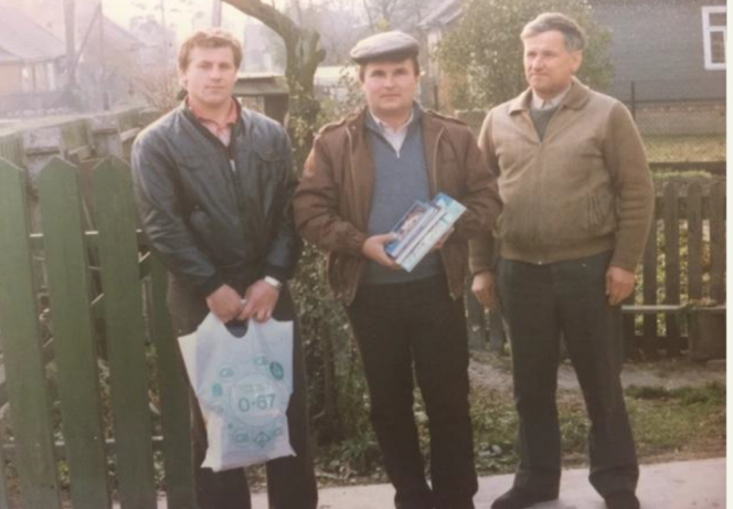
Dad with Russians who came for Bibles.