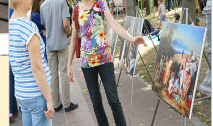
Street evangelism using reproductions of paintings that have Bible themes.

How we praise God for giving us such a wonderful ministry as well as the health and stamina to do it. We know that this is all a matter of grace. We are also thankful for all of you who pray for us. We are confident that through your faithful prayers we have been sustained. Your faithful support is so much appreciated. Thank you.