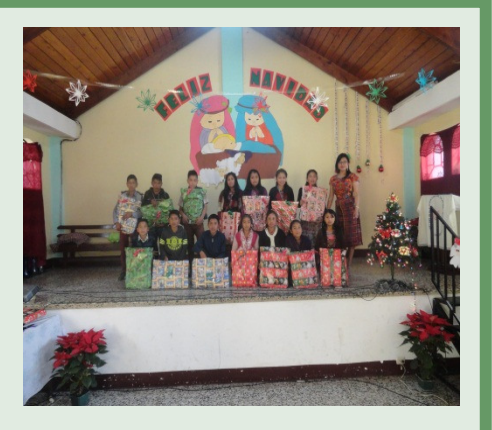
TEENAGERS 2ND & 3RD GRADERS 4TH-6TH GRADERS