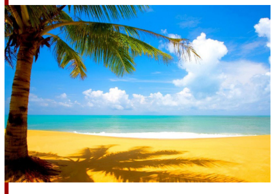
Hello from the Library!