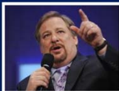
Rick Warren, cited in Oakland, Kindle edition.

"I stand before you confidently right now and say to you that God is going to use you to change the world...I'm looking at a stadium full of people right now who are telling God they will do whatever it takes to establish God's Kingdom "on earth as it is in heaven." What will happen if the followers of Jesus say to Him, "We are yours?" What kind of spiritual awakening will occur?"